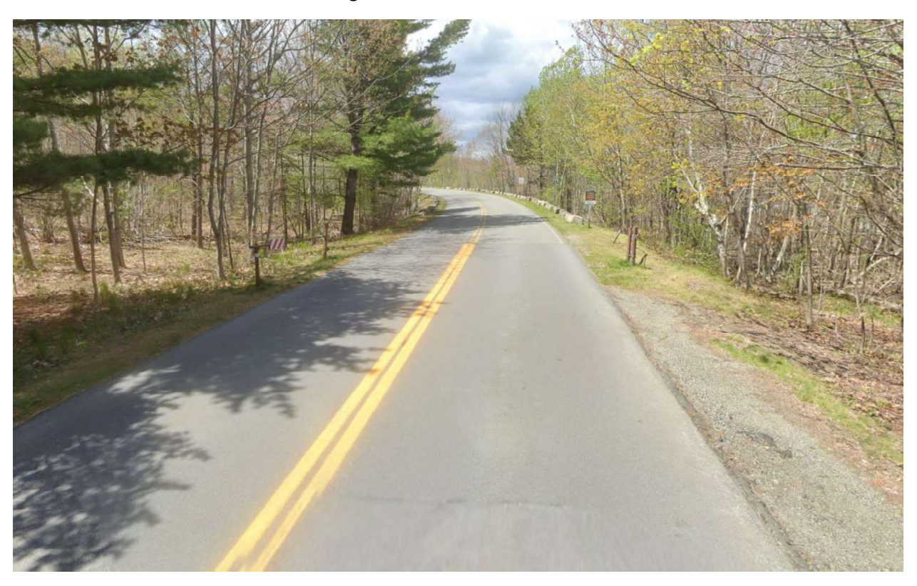
End of West Street Extension – Traveling West