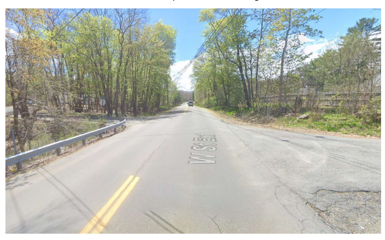
Intersection of West Street Extension and Prospect Avenue – Traveling East